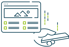
INSTANT DELIVERY NO APPS TO DOWNLOAD

Show-Your-Badge programs are popular among attendees, but their success has been difficult to measure in the past. Bandwango changes that. With a digital Show-Your-Badge platform, destinations can now communicate their discount programs and paid passes to conference attendees and track those who redeem offers and discounts at local establishments. By digitizing this asset, destinations are able to quickly set up both customized perks and paid destination experiences via thoroughly branded convention and event microsites with no app to download. Paid and free pass passes thrive in Show Your Badge passes and deliver the best of your destination to attendees for a conference experience like no other.