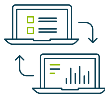
EASILY CUSTOMIZED FOR EACH CONVENTION