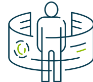
VISITOR DATA THAT DEFINES TRUE IMPACT